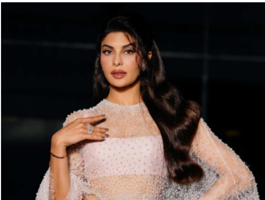
Actor Jacqueline Fernandez, who has been in the news for her alleged links with conman Suresh Chandrashekar, has taken a significant legal step in the ongoing money laundering

case. According to reports, Jacqueline has approached a Delhi court expressing her willingness to turn an approver in the case. This means she is ready to provide information that could assist the investigation.