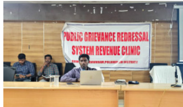
and school gardening activities in educational institutions across the district. Officials from the Education, Tribal Welfare, and Social Welfare departments attended the meeting.