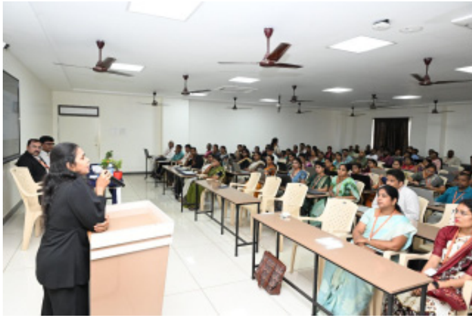
Gandepalli, June 2: A two-day Faculty Development Programme on "Google Artificial Intelligence Tools" commenced at the Department of

Information Technology, Surampalem. Deputy Pro-Chancellor said the programme aims to equip faculty members with practical knowledge of AI ap-