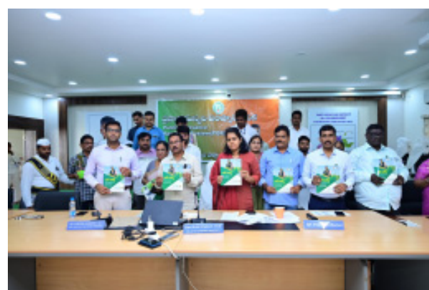
Samstha and Rythu Seva Kendras. Officials from the agriculture and revenue departments attended the programme.

She highlighted techniques such as pre-monsoon dry sowing, seed balls, drought-proof models, and semi-circular cultivation methods as useful strategies. Technical guidance will be provided to farmers through village-level support systems coordinated by the Rythu Sadhikara