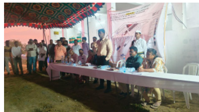
addressed promptly and that the district administration would extend full support to the rehabilitation process.

their issues and requirements. The Collector stated that 88 affected families have been resettled in the Erraboru Rehabilitation and Resettlement (R&R) Colony and are being provided all benefits under the government's R&R package. He also directed officials to further improve basic amenities such as drinking water, electricity, roads, sanitation, and drainage facilities in the colony. Officials assured residents that their grievances would be