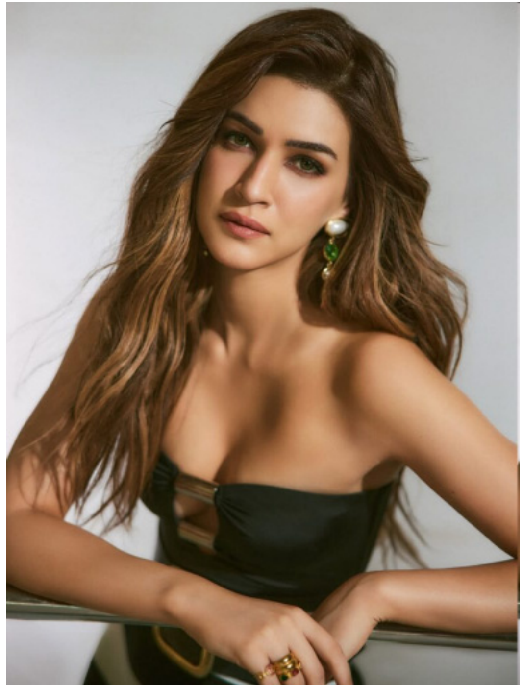
Kriti Sanon made a striking appearance at the Bandhu 2.0 song launch for her upcoming film Cocktail 2. She wore a strapless black bodice with cutout detailing and a statement gold buckle belt, paired with a colorful striped skirt in black, white, green, orange and purple. Her wavy hair and bold earrings completed the look. The actress has been receiving praise for her on-screen chemistry with Shahid Kapoor in the film.

Bandhu 2.0, a recreated version of the popular track Tumhi Ho Bandhu, brought Kriti, Shahid Kapoor and Rashmika Mandanna together for a lively dance number, composed again by Pritam. Cocktail 2 is directed by Homi Adajania and also stars Rashmika Mandanna in the lead. The film, which explores themes of love and friendship, is scheduled to release in theatres this Friday, June 19. Written by Tarun Jain and Luv Ranjan, the trailer has already created buzz among viewers.