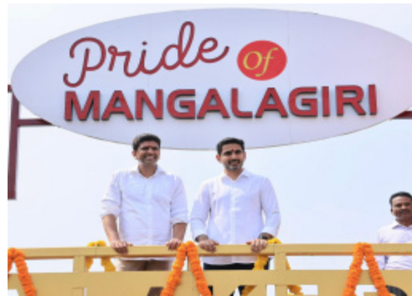
form Mangalagiri into a model constituency, while Nara Lokesh reaffirmed his commitment to fulfilling development promises and enhancing public infrastructure.

Speaking on the occasion, Dr. Pemmasani said the Centre and State governments are working together to transform Mangalagiri into a model constituency, while Nara Lokesh reaffirmed his commitment to fulfilling development promises and enhancing public infrastructure.