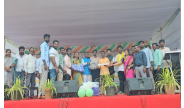
by public representatives, officials, and beneficiaries of various welfare schemes, who shared their experiences and views on government initiatives.